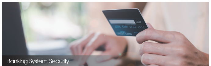
Banking System Security