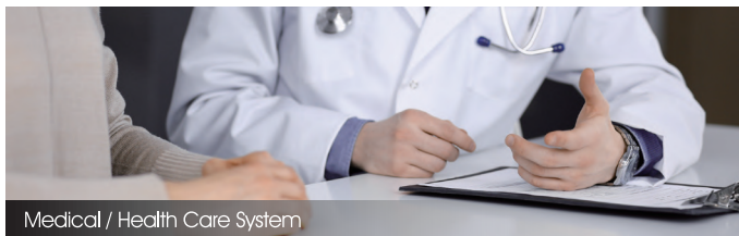
Medical / Health Care System