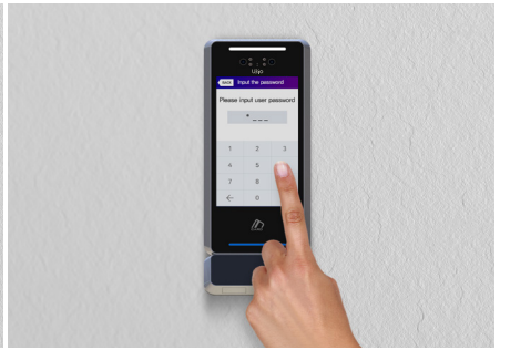
FINGERPRINT QR Code PASSWORD